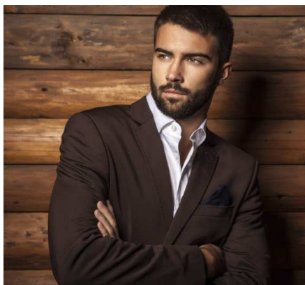
EU07332A - 1510